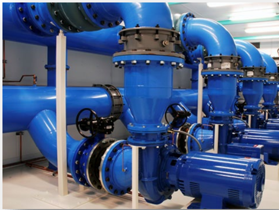
Water and Sewer PS

The Miami-Dade Water and Sewer Department seeks the services of a Consultant for the study, planning, design, permitting, construction management, inspections, and related services of water and wastewater collection and distribution systems .