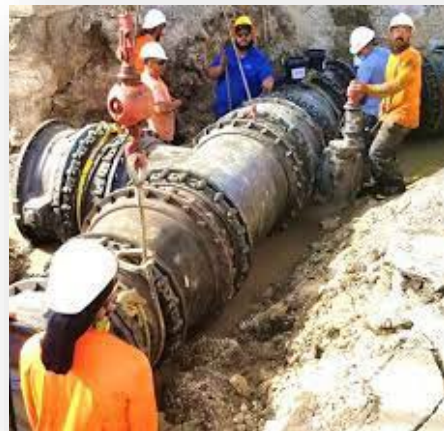
Water Mains & Force Mains